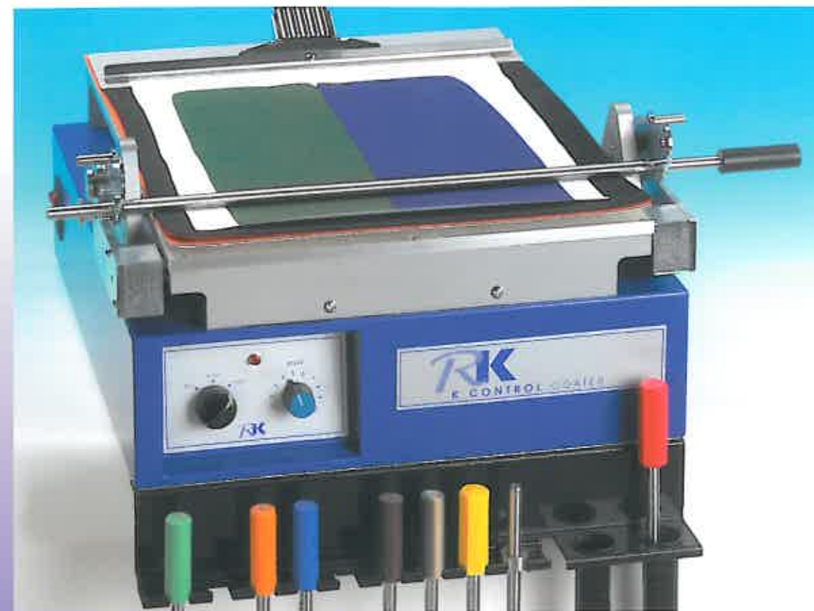
Above: K Control Coater model 202 Below: K Control Coater model 101