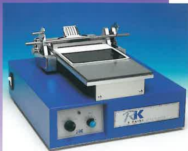
The K Paint Applicator

Used for the application of paints to produce highly accurate and repeatable coatings in an instant. The machine uses gap applicators to coat onto paint test charts, steel panels and many other substrates. This may then be used for many applications including quality control – weather testing, opacity and other standard tests such as colour matching and customer presentation samples.